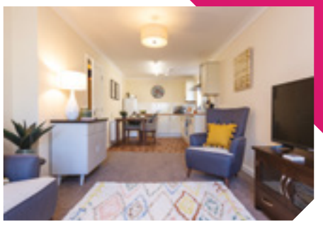
OPEN PLAN LIVING SPACE

Communal meeting rooms and laundry facilities are available to all residents of Wright's Court and Park Court.