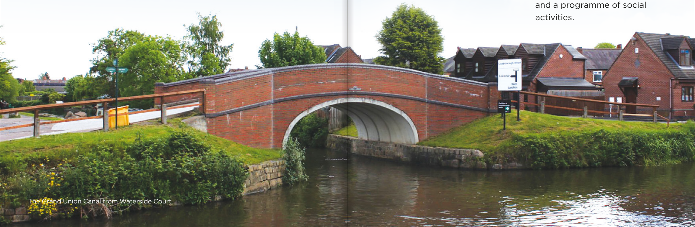
The Grand Union Canal from Waterside Court

The Extra-Care Manager will support tenants to develop a tenant committee and a programme of social activities.